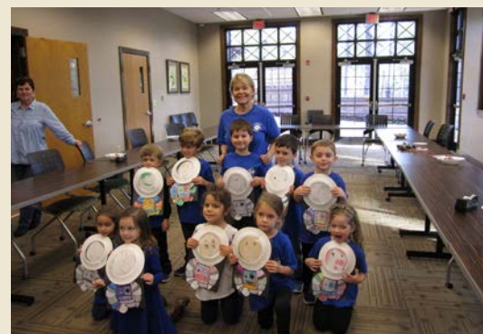
Thomas Jefferson Academy