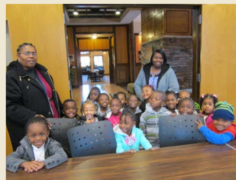
Wadley Head Start