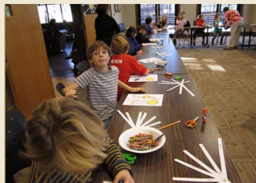
Edmund Burke Academy

What a fun month we had with students from Edmund Burke Academy, Thomas Jefferson Academy, and Wadley Head Start!